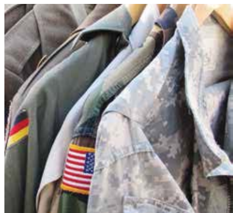
A selection of uniforms from many different eras.

pins, patches, books, hats, caps, jackets and uniforms, and all available for purchase. And as I walked further down the narrow passageway of the store, I stopped hearing the sound of the war movie playing in the front and I became serenaded by songs playing from the old fashioned radio. When I reached the back of the store I felt as if I became trapped in a memory of what life once was. Over the years the store has increased its merchandise simply from civilians bringing items in. The World War II store is not only known for its collection but for the way it acts as a museum where visitors can take a piece of history home with them.